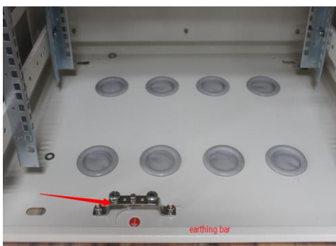
Copper Earthing Bar