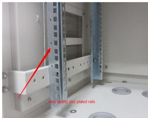
Dust-proof Metal Cover