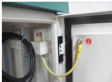
Copper Earthing Bar