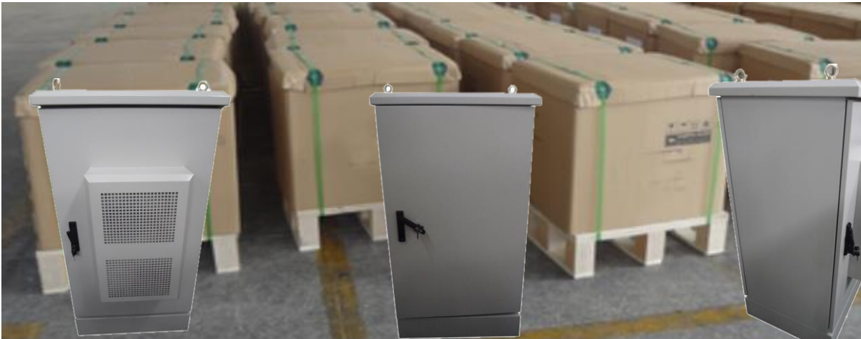
Front Door View