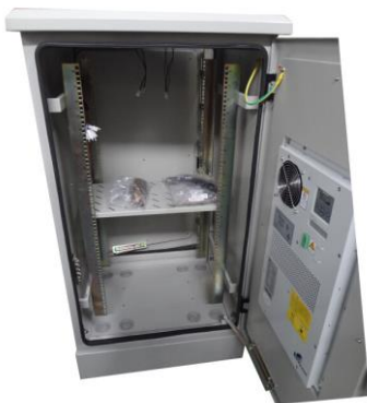
Inside View Zinc Plated 19" Rails